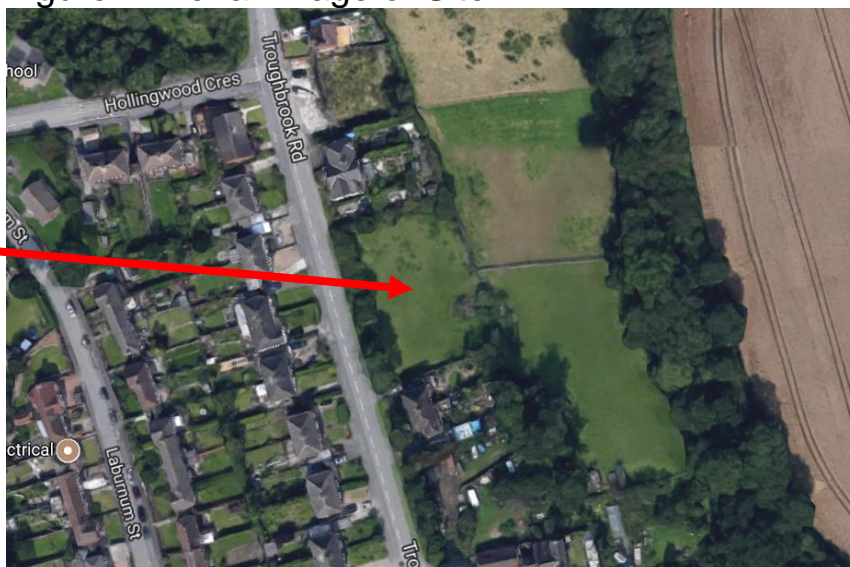
Figure 1: Aerial Image of Site